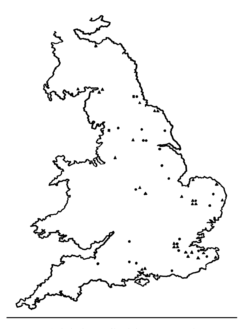
Plate A Distribution map of inscriptions on moveable objects